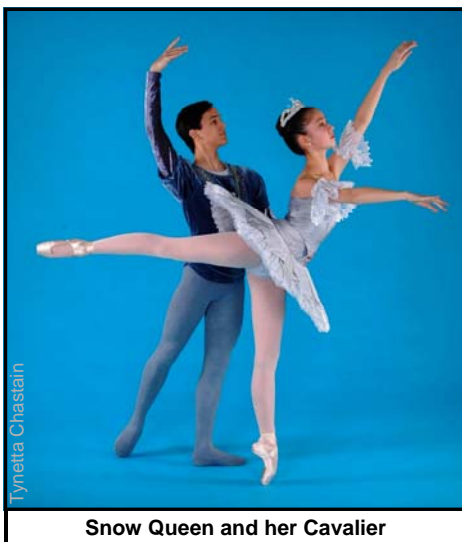
Snow Queen and her Cavalier