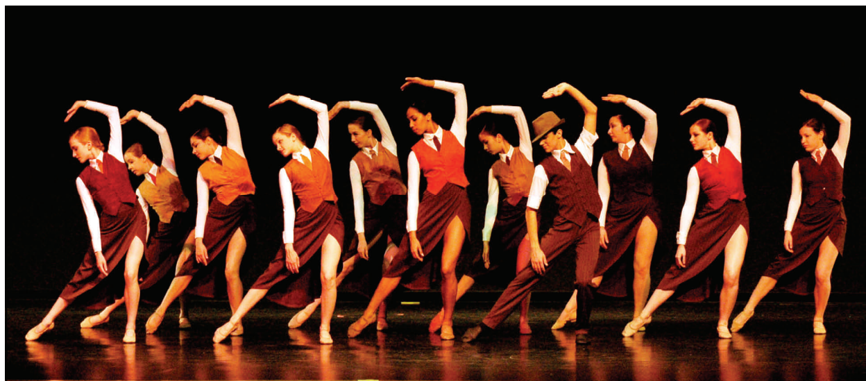
Alexandra Ballet performing Hora Tango

Alexandra Ballet will have the opportunity to shine brightly amongst the best of the world.