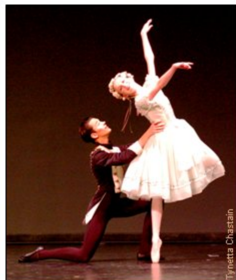
Pollacca Guerriera - 2007

Alexandra Ballet will also celebrate National Dance Week with an intimate in-house Dancers' Choice Performance on Sunday, May 1, 2011 at 2:00pm and 5:00pm at the company's home, Alexandra School of Ballet. Come see Alexandra Ballet Company dancers perform a wonderful variety of pieces from their favorite repertoire, new choreography, a glimpse into next season and more. This performance will give you an intimate look into our company's talents. Seating is limited for this up close and personal look at the ballet stars of the future. Adults $10 and Children $5. Contact Alexandra Ballet at 314-469-6222 to purchase tickets.