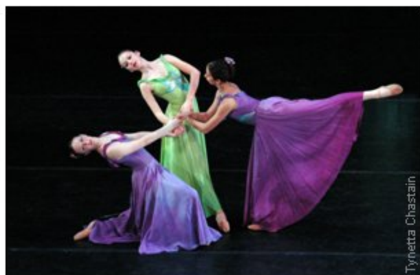
Giverny at Gems of the Ballet - 2011

Come see Alexandra Ballet and over 50 other dance companies in the St. Louis area at the festive celebration of dance in honor of National Dance Week on Saturday, April 30th at St. Louis Union Station. The public will view, free of charge, ballet, jazz, tap, modern, and folk dancing. Alexandra Ballet will perform Giverny , a contemporary ballet, which pays tribute to