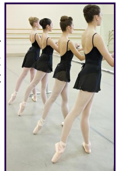
Cincinnati Ballet's Summer Program