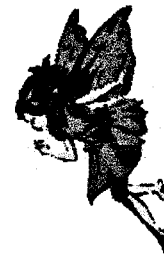
Midsummer Night's Dream at Powell Symphony Hall

Our address is: Alexandra Ballet, 68 Four Seasons Center, Chesterfield, Missouri 63017